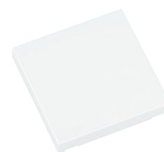
RTS34-ACC-01-xxP 1x ON/OFF